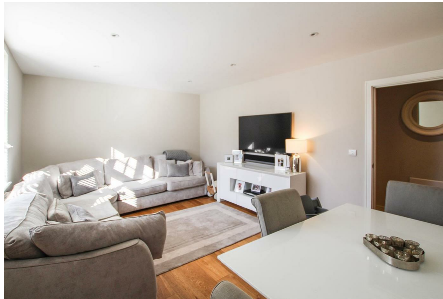
6 Campbell Court The Galleries, Warley, Brentwood, CM14 5GN

TOTAL APPROX. FLOOR AREA 651 SQ.FT. (60.4 SQ.M.) THIS PLAN IS FOR ROOM IDENTIFICATION ONLY, AND ITS ACCURACY IS NOT GUARANTEED. www.epcsinsex.co.uk Made with Metropix ©2019